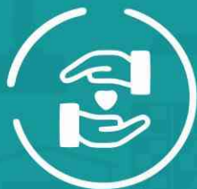
Creating Long- Lasting Bond