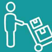
Empty Container Handler