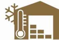
Temperature Managed Warehouse