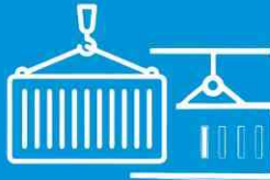
FCL and LCL Booking Services