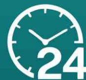
Overnight Freight Service