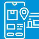
Arrange Pick Up & Delivery Locations

VS Trans Lojistik offers cost-effective and outstanding logistics solutions to meet your ocean freight transportation needs. We offer an extensive array of international sea freight services that is customized according to your needs from FCL to LCL on all major routes worldwide.