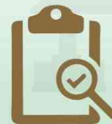
Quality Control Check