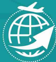
World Wide Carrier