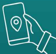
Track and Trace System