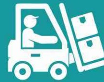
Hydra / Forklift

Skilled Labour for Stuffing / De-stuffing the cargo.