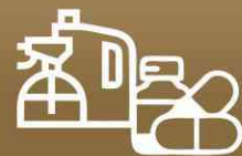
Handling Sensitive Products