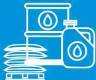
Dry And Liquid Bulk Shipment