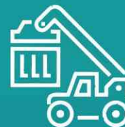
Modern Container Handling Equipments